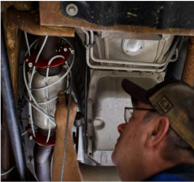
Catalytic Converter with cable installed

~ Continuation : How will you know if yours has been removed?